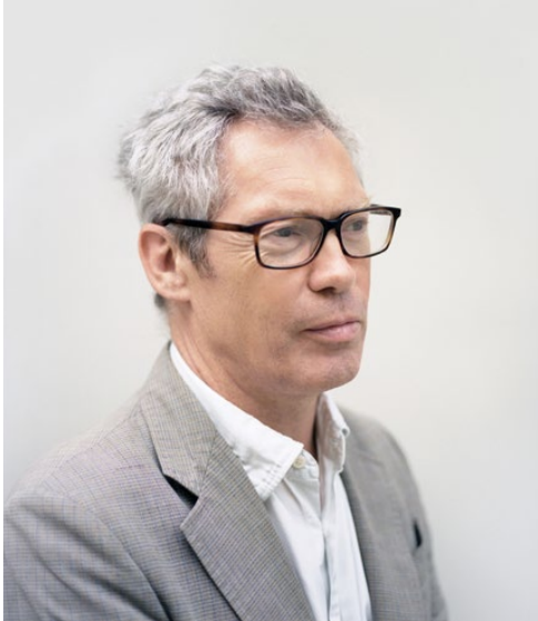
JASPER MORRISON , 2012