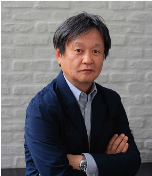
NAOTO FUKASAWA , 2009

"All along, I had wanted to design good wooden chairs. I thought that good chairs would be ones that became permeated with a flavor of daily living as they were used over a long time. Like the plain-wooden chairs of Scandinavia for example, which by now have become a staple all over the world. Rather than 'design' as such, what they have is the glow of artistic handcrafting. Japanese wooden products have the same kind of artistic element, and the unfinished (no finish) ones especially – mainly made from cypress – give a sense of refined, immaculate, exalted purity. What I aimed for in this chair was a refined and pure aura that at the same time has human warmth."