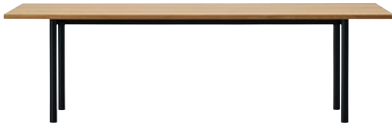
TABLE [Steel leg] 180, 200, 220, 240, 320 (rectangular) Low, High, or Extra High