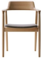
ARMCHAIR (cushioned) Low or High